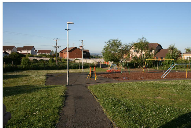
The park as it is now and the drawing of what it could look like.